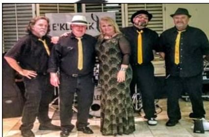
Music by E'Klektik

The same great band we have enjoyed so much!!!