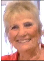
Dorothy Vaughn Boosters president

Anyway, we couldn't come up with anything for Labor Day for all of you, but we have something planned for October, (seeing that our Halloween Soup & Salad is not happening.) We'll