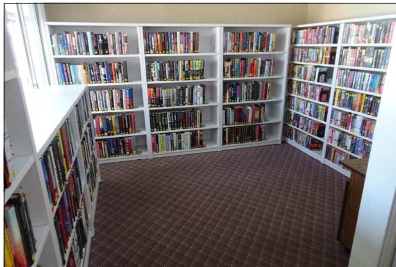
New layout: The main Spring Knolls Library room no longer has bookcases in the center that often made browsing difficult.

more Large Print books and will be buying new ones as funds become available. We hope to use proceeds from sales of excess books at the Bargain Festival (date not yet set) for just that reason.